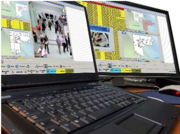
TXG: The Efficient way to control a Site Wide Emergency Management System

Tyco Expert Graphics is a fully featured emergency management system that has been specifically designed to present alarm information clearly and precisely, to speed up response times and ensure that the most appropriate response decisions are made.